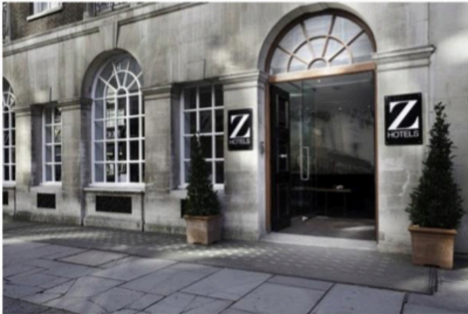
The fabulously central Z Hotel, Victoria

Located right by Victoria station (ideal for the Gatwick express), this contemporary hotel is the perfect place to stay before catching a honeymoon flight to warmer climes. It's also an ideal location for out-of-towners who want to spend a weekend in London shopping for their dream wedding dress .